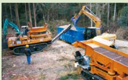
MC-2000 Forest Remaining Wood