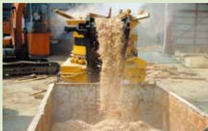
MC-2000 Construction Waste