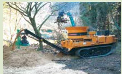
MC-2000 Culturing Mushroom Bed