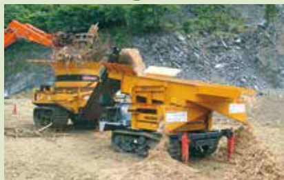
MC-2000 & Rotary Screen (MRS-24)