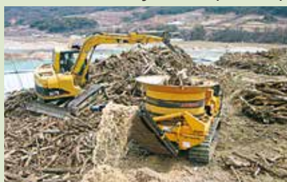
MC-6000 Dam Driftwood