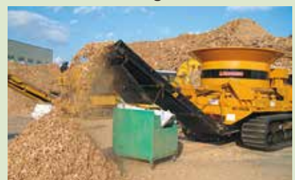
MC-6000 Abolished Palette